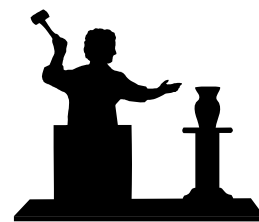
Silent Auction #5

There was plenty of BBQ to go around , pork steaks , hamburgers , brats, potato salad , corn, chips , and lots of goodies . The auction made about $2000 for the activities fund and softball team . But it was a lot of fun for both guests and members who worked it or attended. Thanks again to all of you who participated we couldn't have done it without you!