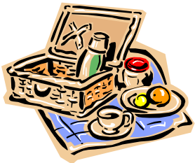
Crider Picnic What a blast !!!